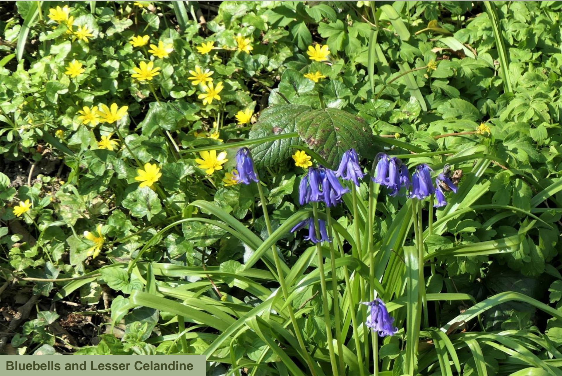
Bluebells and Lesser Celandine