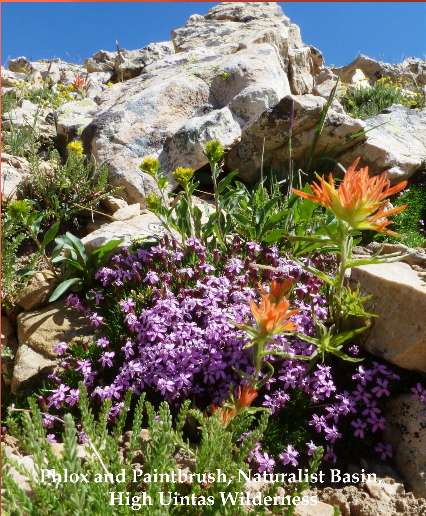
Phlox and Paintbrush, Naturalist Basin, High Uintas Wilderness